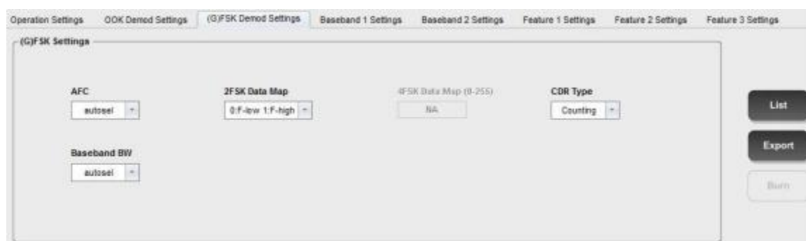
Figure 3. FSK FSK Demodulation Configuration GUI