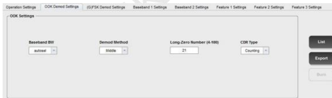
Figure 2. OOK Configuration GUI

Suggestions for OOK demodulation configuration are shown as follow.