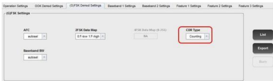
Figure 4. CDR Configuration Parameter

The suggestions on CDR demodulation configuration are as follows.