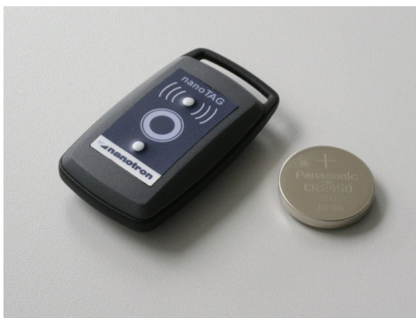
nanoTAG RTLS Tag

Through its air interface, the nanoTAG RTLS Tag supports bidirectional payload exchange between the Location Server and individual tags.