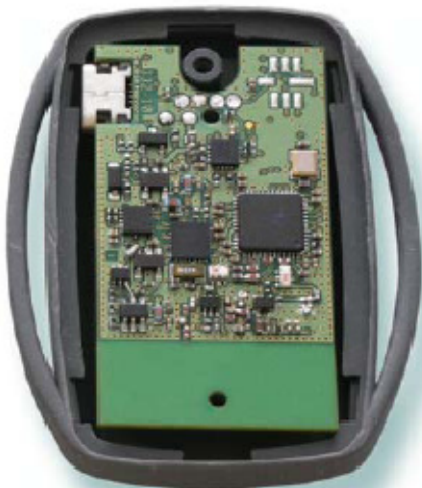
nanoTAG RTLS Tag Housing

The charging temperature range is from 5 to 40 °C. When the battery is being charged, a bi-color battery status LED is illuminated.